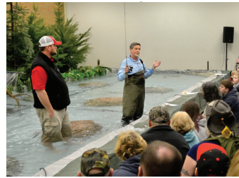
INDOOR STEELHEAD RIVER Showplex

The floor plan is subject to change. Every effort has been made to ensure accuracy until and through press time. Last-minute changes or additions are at the show office. Show admission refunds will not be granted due to a change in listing.