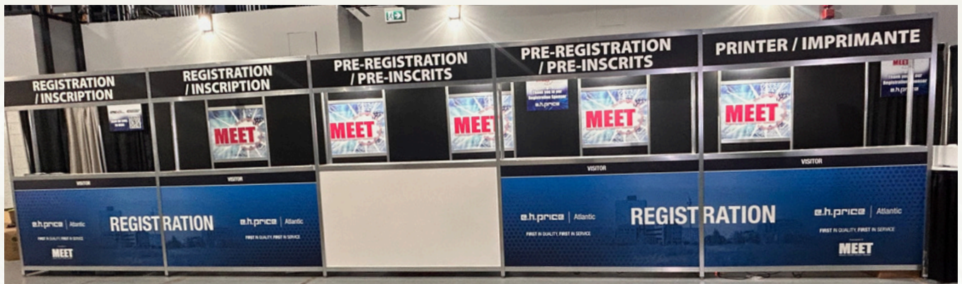
Example of sponsored registration.

Your company's logo will be prominently displayed on registration signage and kiosks, as well as on our website, creating a strong visual presence that establishes your brand as a trusted partner in the trade show experience.