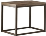
Wood/Metal End Table