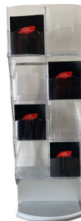
Literature Stand double