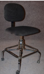
Stools - Highback Manual