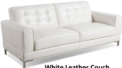
White Leather Couch