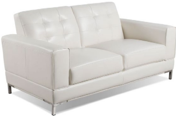
White Leather Loveseat