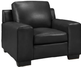
Black Leather Armchair