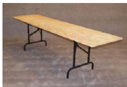
Undecorated table (8' shown)