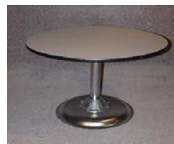
Round Coffee Table 18" high