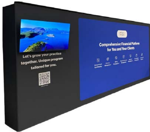
6 meters - Fabric Wrap Display TV options available - as shown exhibitor keeps fabric graphics