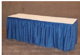
6' Skirted table (blue shown)