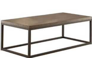
Wood/Metal Coffee Table