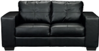
Black Leather Loveseat