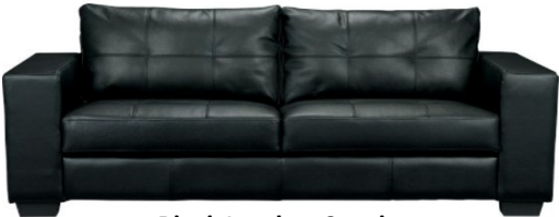
Black Leather Couch