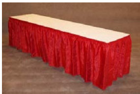
8' Skirted table (red shown)