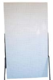
Peg Board - Vertical