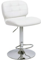
White Adjustable Stool