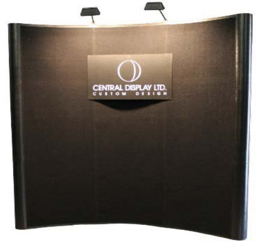
Pop-up Display - 10' wide x 8' tall