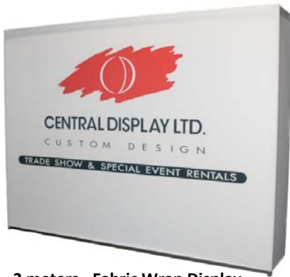
3 meters - Fabric Wrap Display TV options available exhibitor keeps fabric graphics