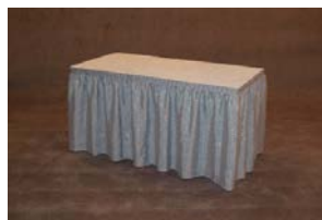
4' Skirted table (silver shown)