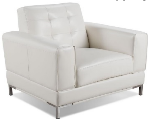
White Leather Chair