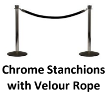
Chrome Stanchions with Velour Rope