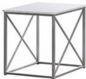
White End Table