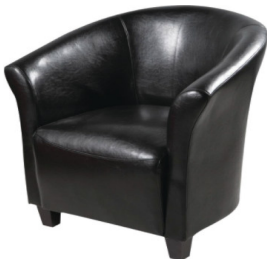
Leather Tub Chair