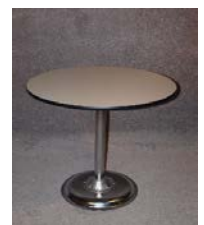
Pedestal table 30" high