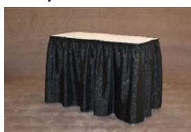
40" high Skirted table (black only)