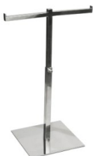
Double sided Bag Rack 50 1/2" up to 71 1/4" high