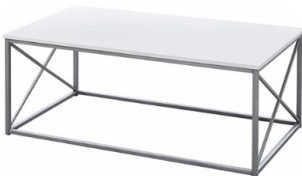
White Coffee Table