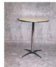
High-top Cruiser table 42" high