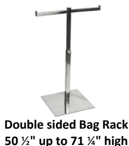
Double sided Bag Rack 50 1/2" up to 71 1/4" high