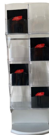
Literature Stand double