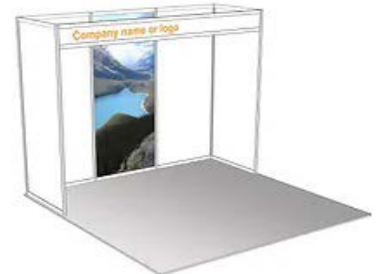
Octanorm - 3 meters shown - Model 100 (signage optional) also available in 6 meters