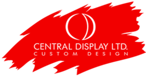
EXHIBIT INSTALLATION SERVICES