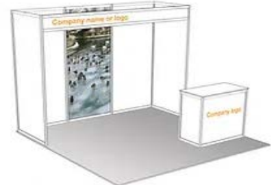
Octanorm - 3 meters with Counter shown - Model 101 (signage optional) also available in 6 meters