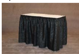
40" high Skirted table (black only)