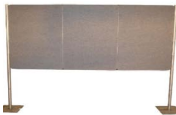
Velcro Poster Board (grey & black side) 4' x 9'