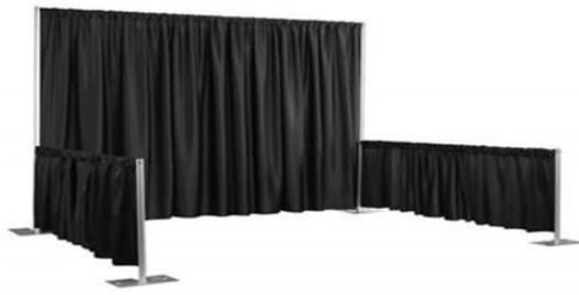
Figure 8' high x 10' wide x 3' front to back sides