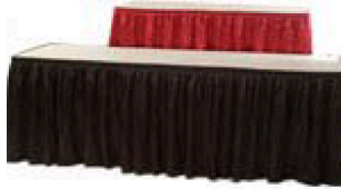
Table Skirt Color: _____ blue _____ red _____ burgundy _____ black _____ green _____ yellow _____ white

(Standard table height is 30in. Add $40 for 40in high skirted table.) (All sizes skirted on three sides. For skirt on 4th side, add $40 on 30in tall table, $60 on 40in tall table)