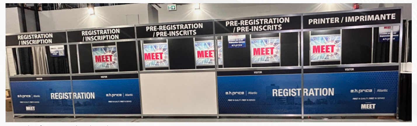
Example of sponsored registration.

By becoming the exclusive sponsor of the trade show's registration process, you will ensure that attendees are greeted by your brand from the moment they arrive. Your company's logo will be prominently displayed on registration signage, kiosks, and on our website, creating a strong visual presence that establishes your brand as a trusted partner in the trade show experience.