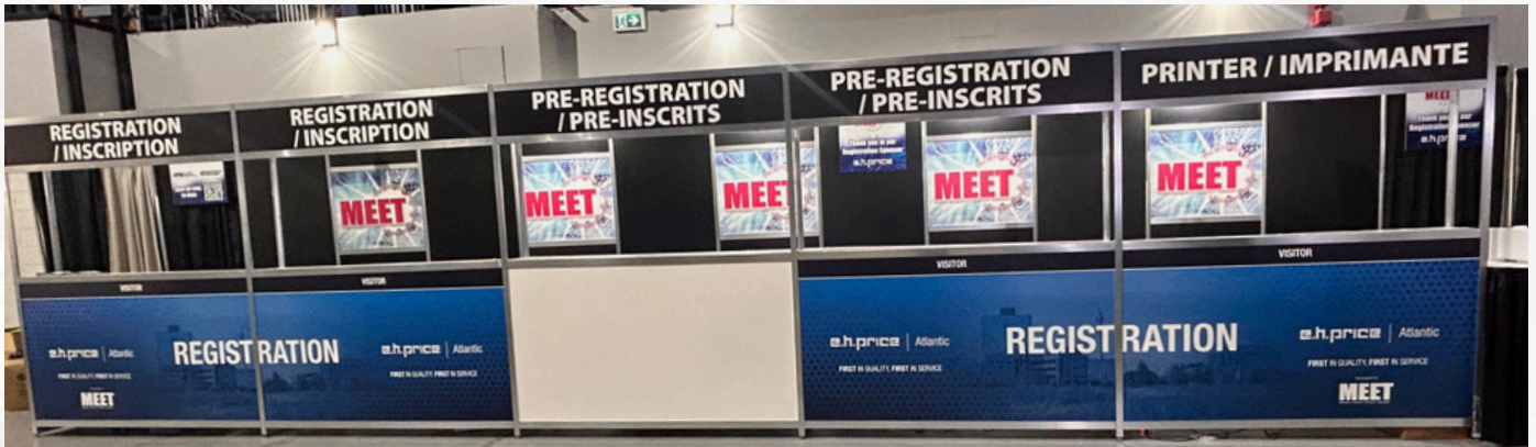
Example of sponsored registration.

By becoming the exclusive sponsor of the trade show's registration process, you will ensure that attendees are greeted by your brand from the moment they arrive. Your company's logo will be prominently displayed on registration signage, kiosks, and on our website, creating a strong visual presence that establishes your brand as a trusted partner in the trade show experience.