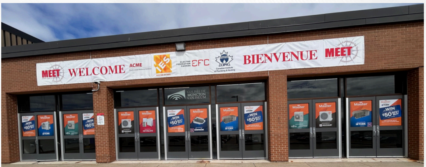
Example of venue branding sponsorship.

Price point is based on custom opportunity.