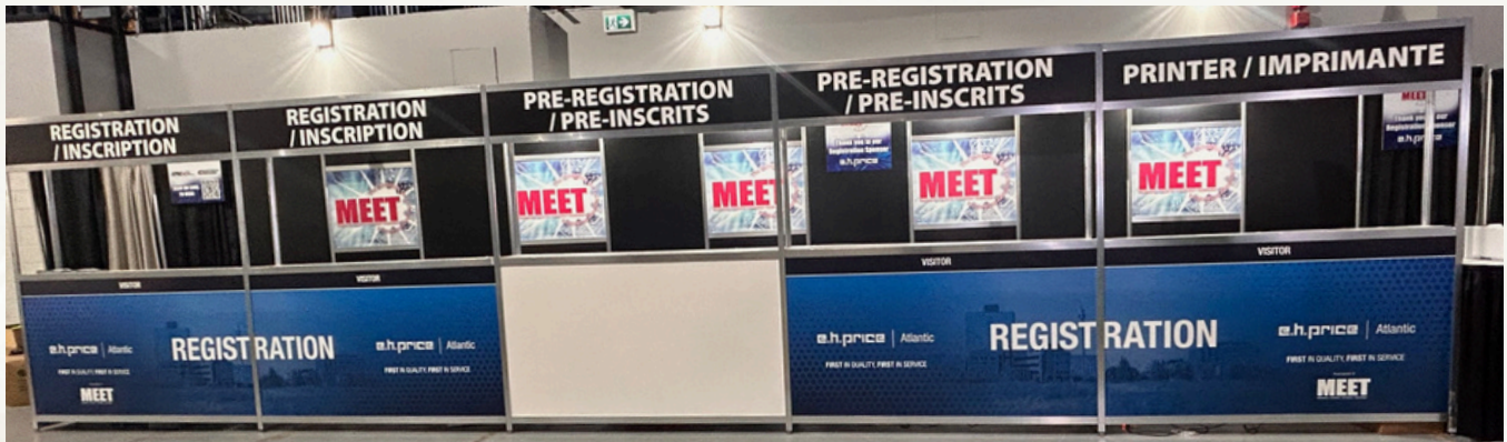
Example of sponsored registration.

By becoming the exclusive sponsor of the trade show's registration process, you will ensure that attendees are greeted by your brand from the moment they arrive. Your company's logo will be prominently displayed on registration signage, kiosks, and on our website, creating a strong visual presence that establishes your brand as a trusted partner in the trade show experience.