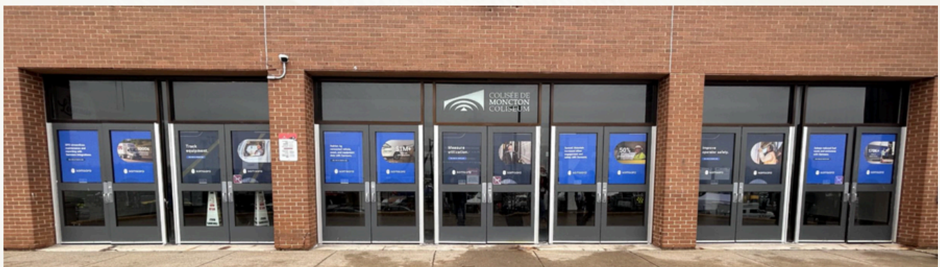
Example of venue branding sponsorship.

Price point is based on custom opportunity.